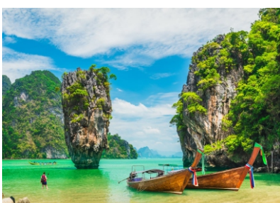
James Bond Island