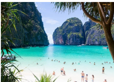
Phi Phi Island