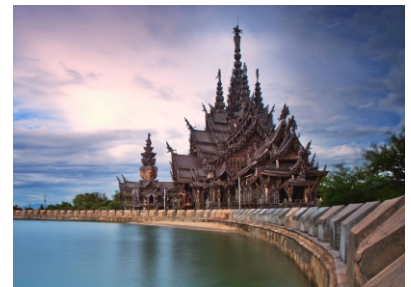
Sanctuary of Truth