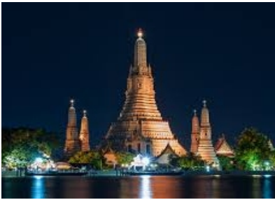
Bangkok City Tour

We offer a wide range of show and sightseeing activities. Stay relaxed and let your clients enjoy incredible guided tours (SIC and Private) wherever required.