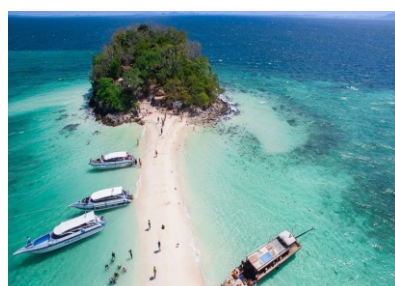
four Island Tour