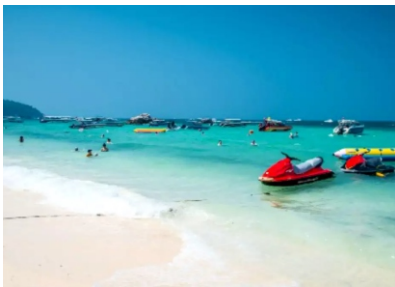
Coral Island Tour